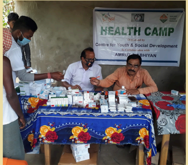
Sanitation & Disinfection work at Krushnagar village Free medicines served to patients at Meduakula GP