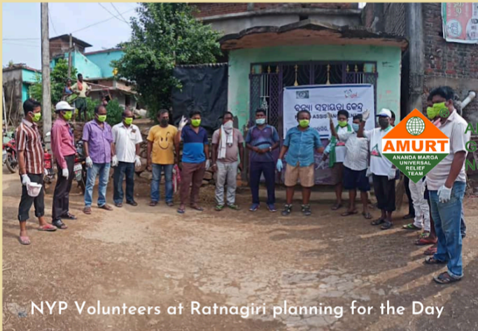
NYP Volunteers at Ratnagiri planning for the Day